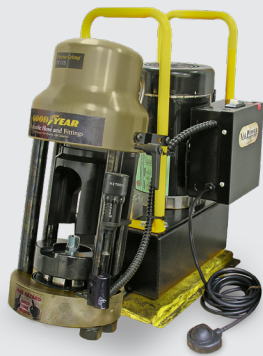
Old Crimper PC125 Crimper Post September 2005 Trade In Value $500.00

Let us help you upgrade your old crimper with our latest PC125-RCD design.