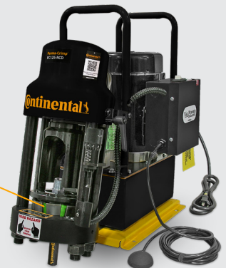
New PC125-RCD SAP# 20809573 (110 Volts Single Phase)