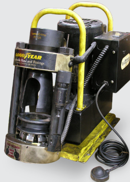
Old Crimper PC125 Crimper Pre September 2005 Trade In Value $375.00