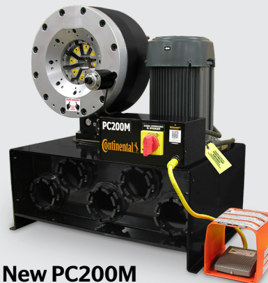
New PC200M SAP# 20442513 (230 Volts Single Phase) SAP# 21095952 (230 Volts 3 Phase) SAP# 21095953 (480 Volts 3 Phase)