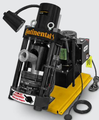
Old PC150 w/DA Tooling Trade In Value $800.00

Let us help you upgrade your old crimper with our latest PC200M design to crimp up to 2" 6 spiral hose.